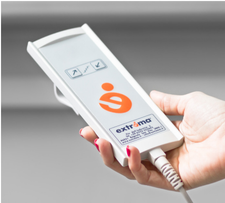
Wander lead for attendant control, with spiral cable.