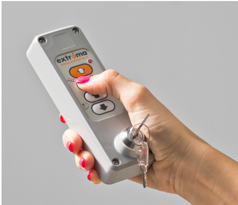
Remote controls to call the stairlift from the floor or send it to the parking position.