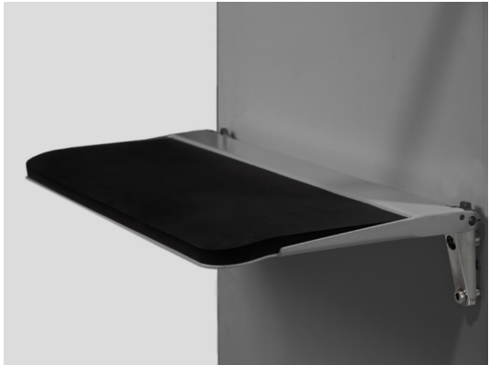
Foldable seat for users not on wheelchair.