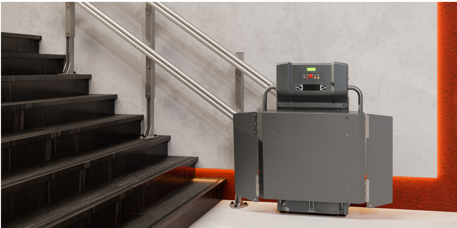
Logic has a very reduced encumbrance in the folded position.